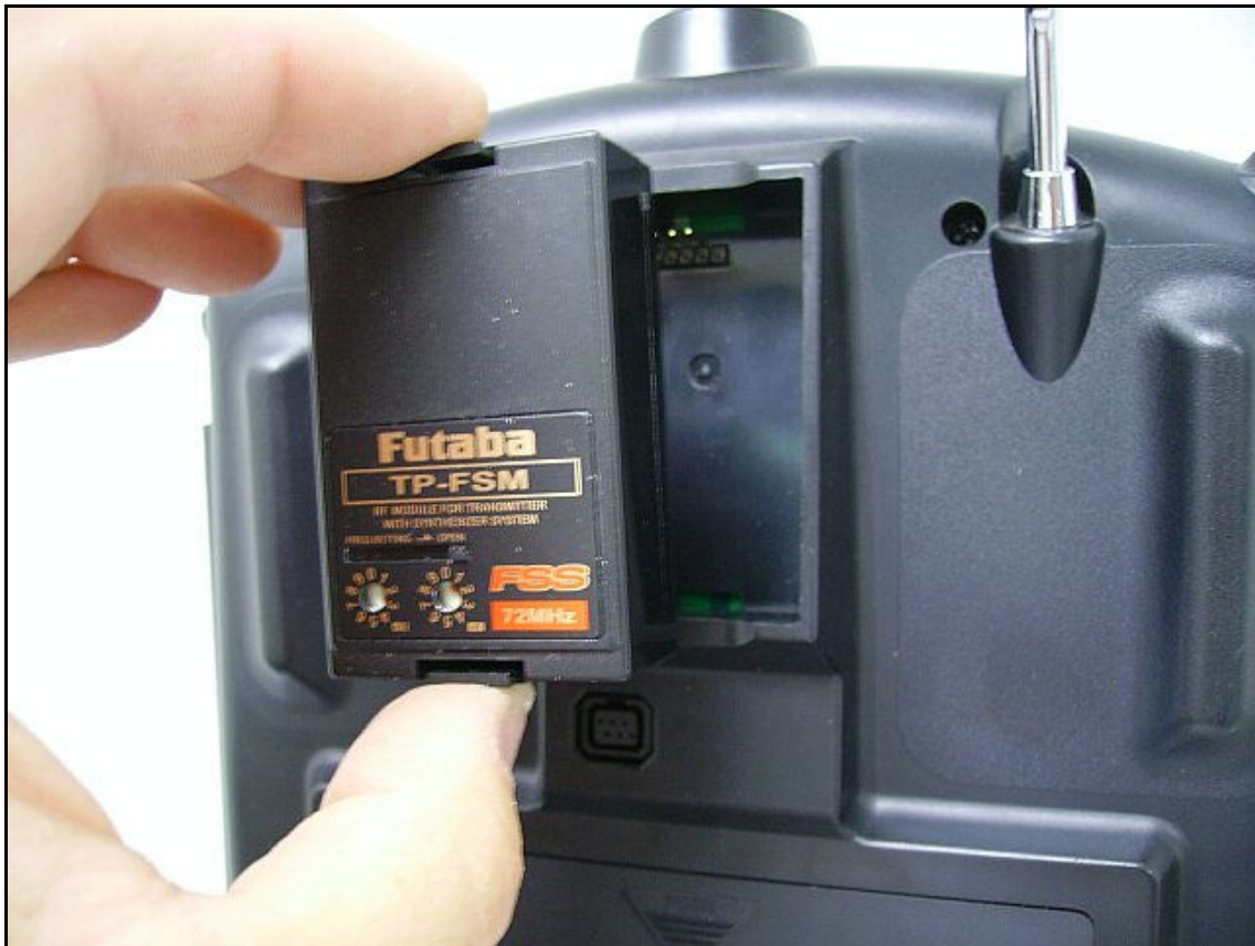
Figure 1 – Futaba RF module removal

Futaba, JR, and Hitec RF modules have tabs either on each side or top and bottom. Carefully squeeze these tabs and pull the RF module from the transmitter. Sometimes each side or each end will need to be wiggled for the module to come loose and removed. See Figures 1 and 2 for reference.