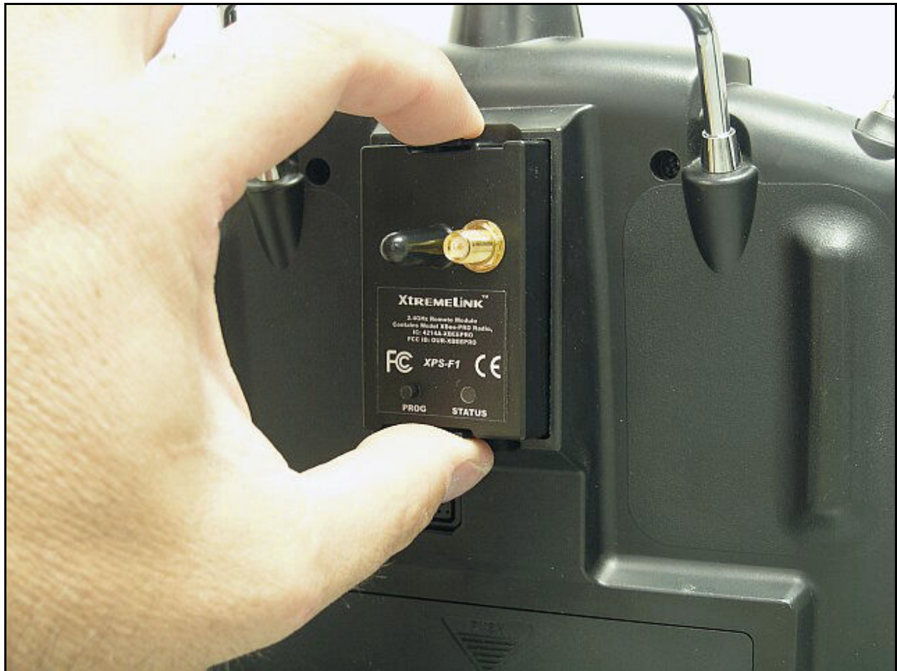
Figure 3 – Futaba XtremeLink® module installation