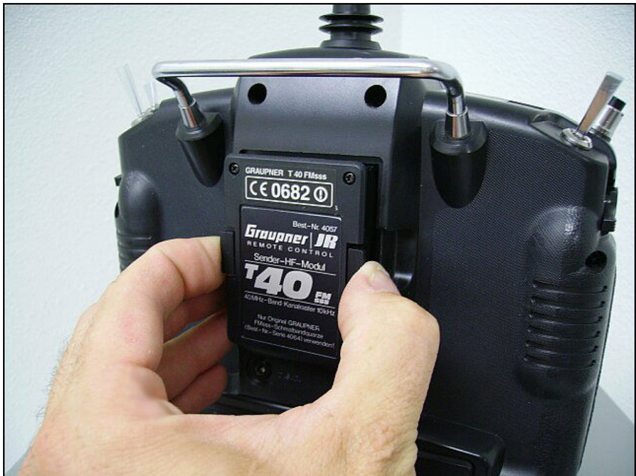
Figure 2 – JR RF module removal