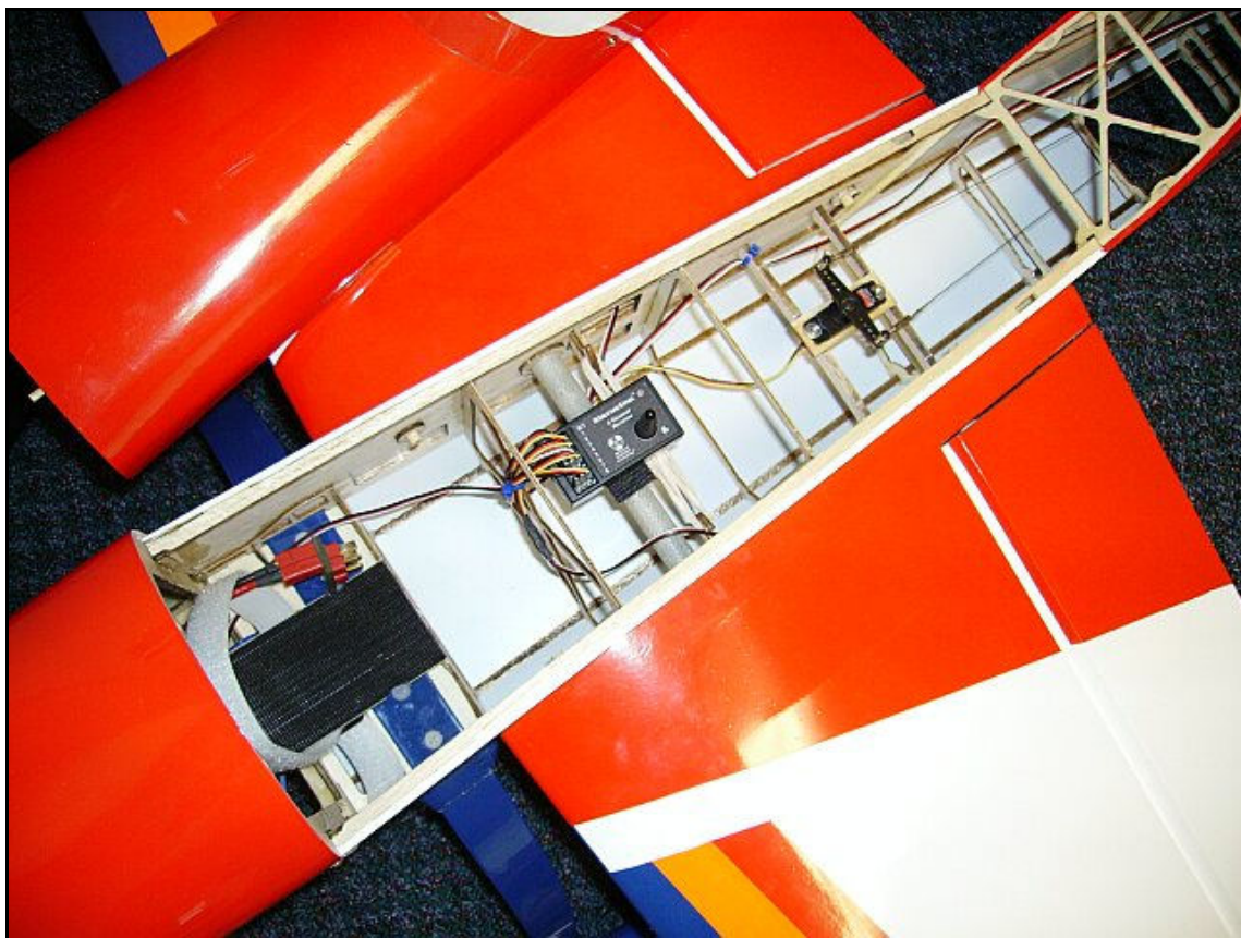
Figure 5 – XtremeLink® 8 channel receiver installation

We have found the best receiver orientation to be with the antenna pointing upwards, which gives the best results when making approaches from far away.