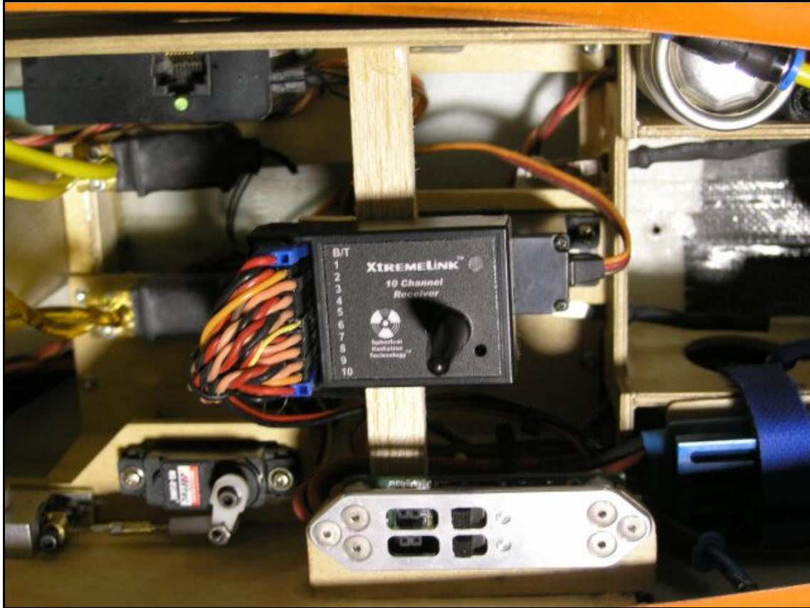
Figure 6 – XtremeLink® 10 channel receiver installation in a Composite ARF Flash jet.

The servo connection slots on the XtremeLink® receivers are numbered. There is a slot that is labeled "B/T". This is for a battery connection, and can also be used for the telemetry sensor data port. Do not plug the power into this port backwards! The receiver will power up and appear to work, but it will not function properly powered this way!