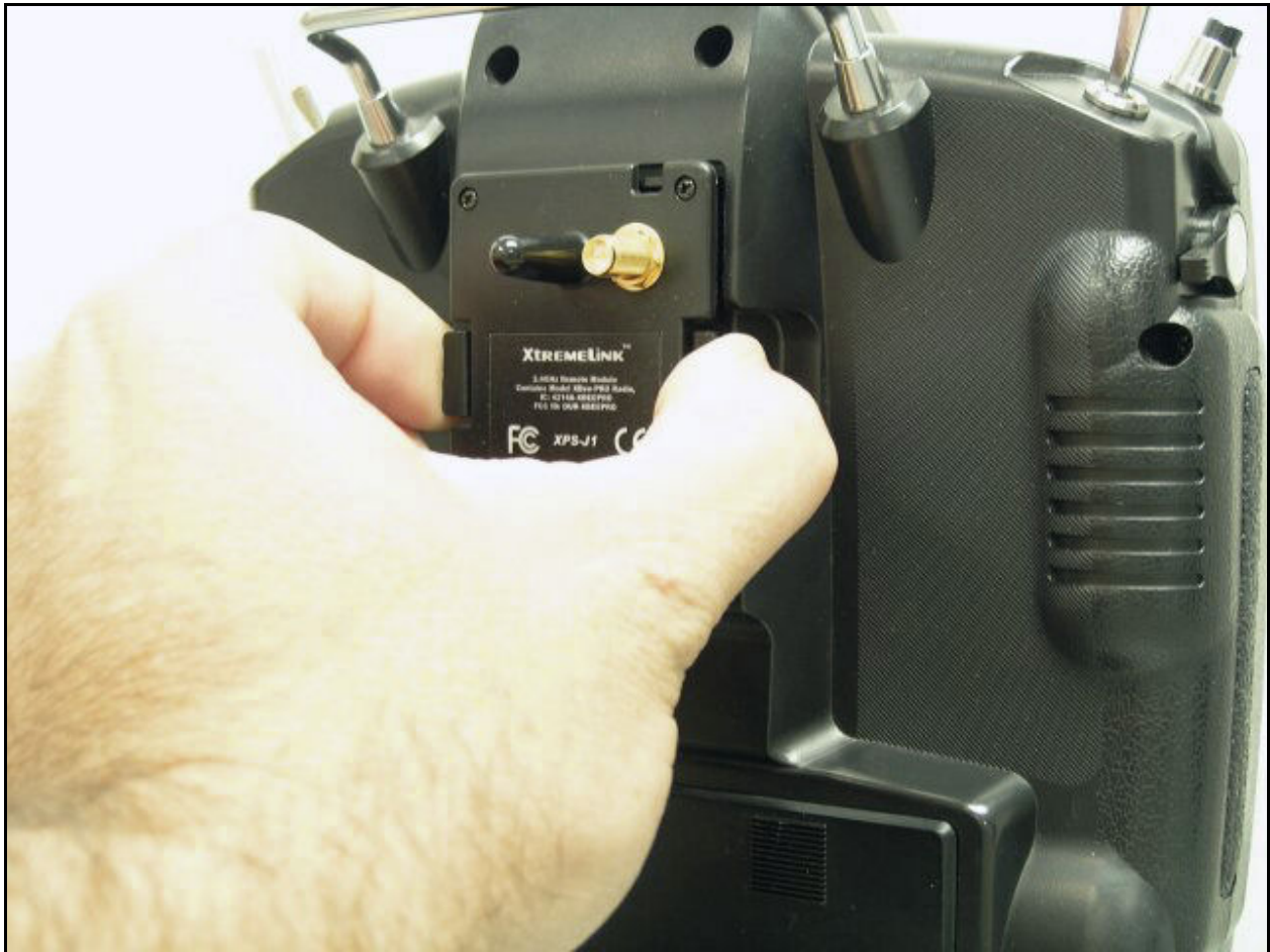
Figure 4 – JR XtremeLink® module installation