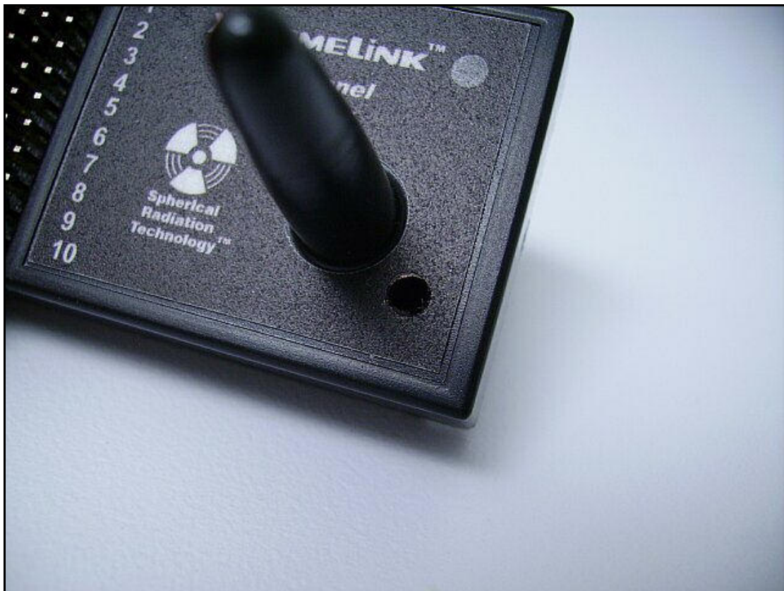
Figure 7 – XtremeLink™ receiver programming button location