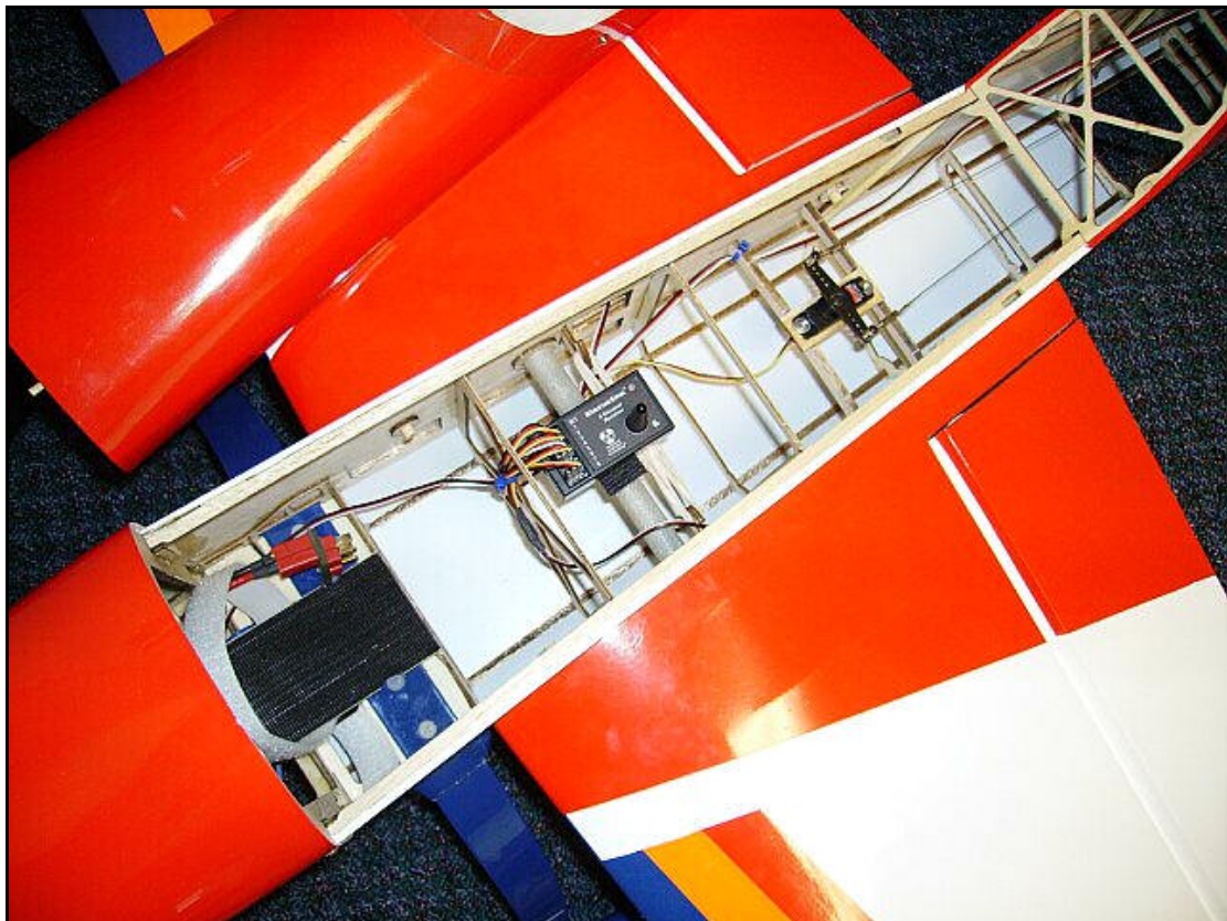
Figure 5 – XtremeLink™ 8 channel receiver installation

We have found the best receiver orientation to be with the antenna pointing upwards, which gives the best results when making approaches from far away.