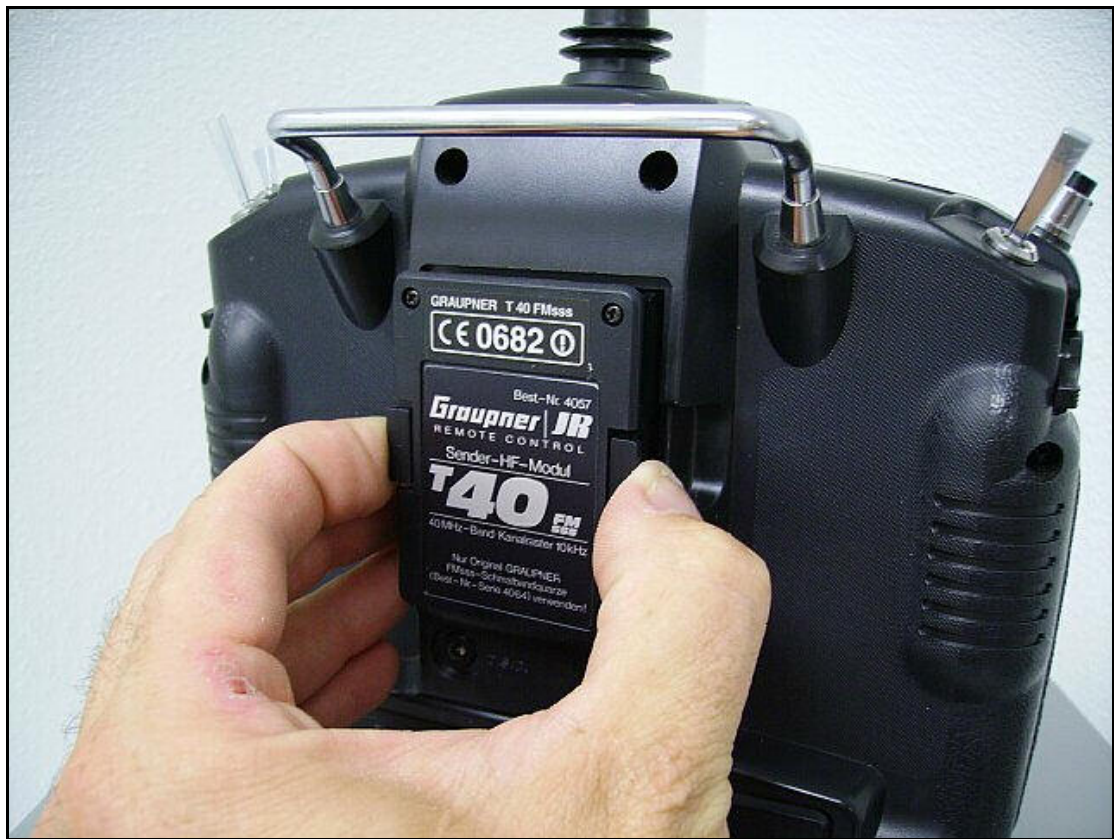
Figure 2 – JR RF module removal