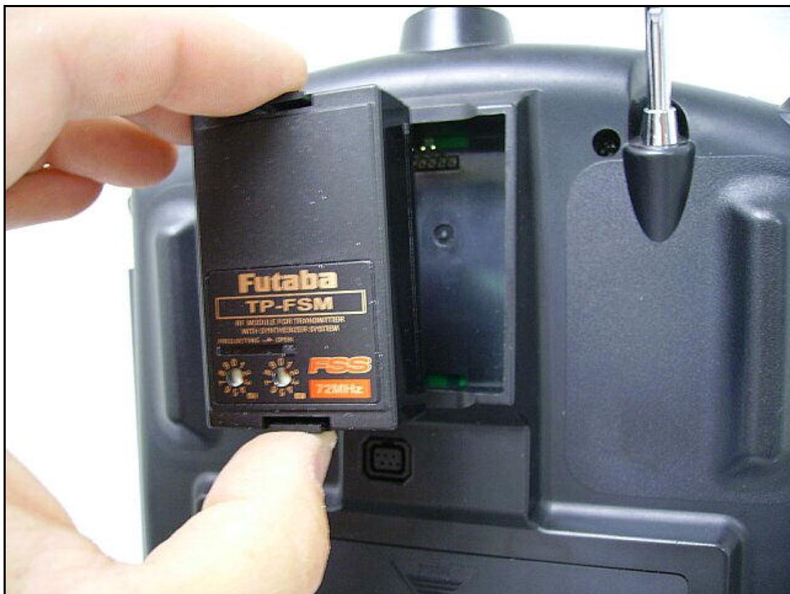
Figure 1 – Futaba RF module removal

Futaba, JR, and Hitec RF modules have tabs either on each side or top and bottom. Carefully squeeze these tabs and pull the RF module from the transmitter. Sometimes each side or each end will need to be wiggled for the module to come loose and removed. See Figures 1 and 2 for reference.