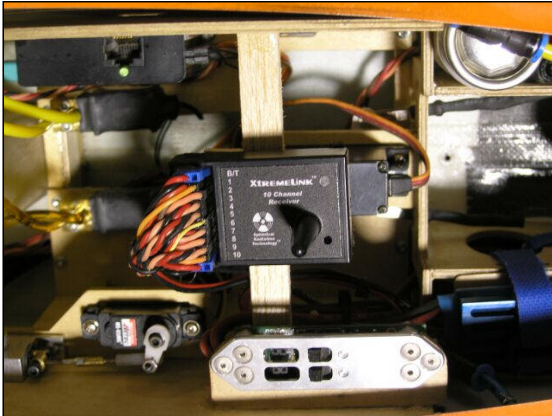
Figure 6 – XtremeLink™ 10 channel receiver installation in a Composite ARF Flash jet.

The servo connection slots on the XtremeLink™ receivers are numbered. There is a slot that is labeled "B/T". This is for a battery connection, and can also be used for the telemetry sensor data port. Do not plug the power into this port backwards! The receiver will power up and appear to work, but it will not function properly powered this way!