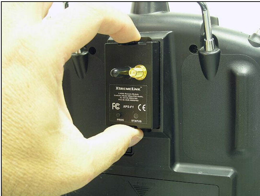
Figure 3 – Futaba XtremeLink™ module installation